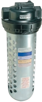
with metal bowl